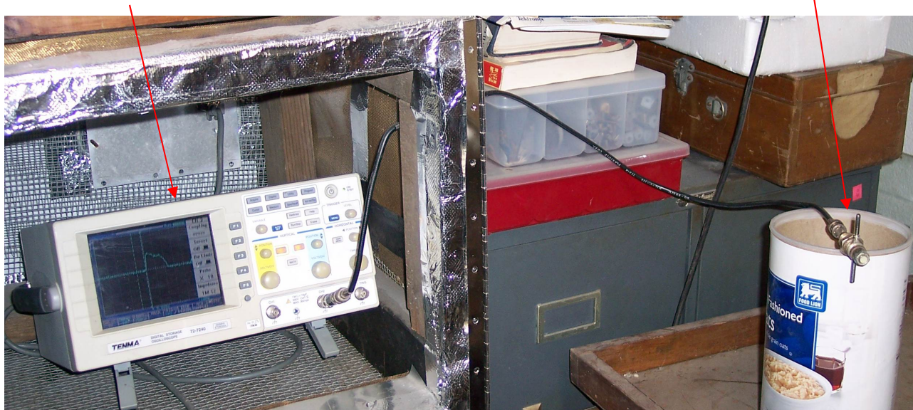
Dipole RF Pickup