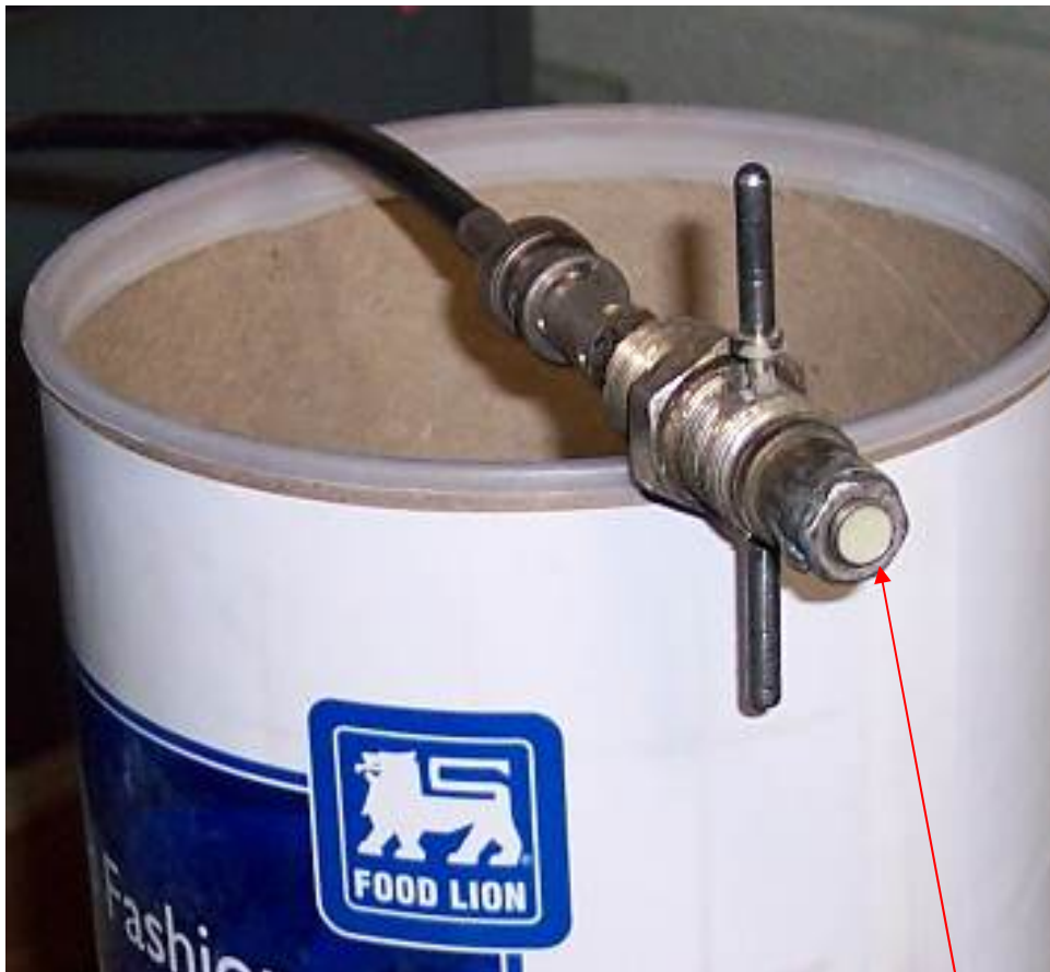
Microwave diode USSR made similar to 1N23